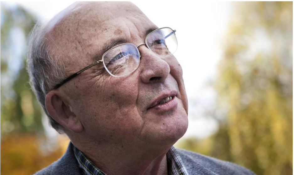
Dale T. Mortensen at Aarhus University.