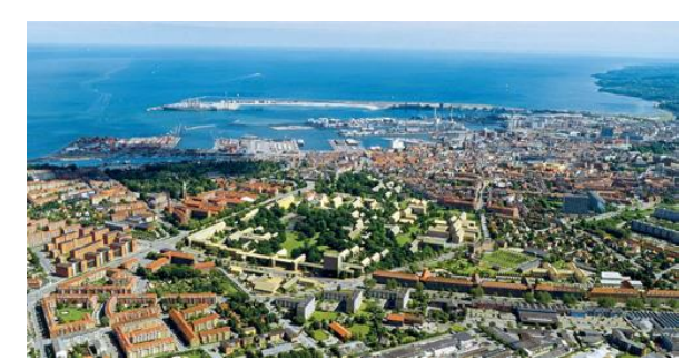
Photo of the campus area (the yellow buildings) and part of the city, 2005.

Aarhus has often been called the 'City of Smiles', and is proud of this nickname. Unpretentious, easy-going, fresh, optimistic, ambitious and buzzing with life. The City of Aarhus's vision is that Aarhus is and continues to be a good city for everyone.