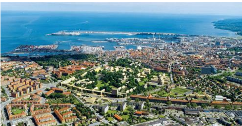
Photo of the campus area (the yellow buildings) and part of the city, 2005.

Aarhus has often been called the ‘City of Smiles’, and is proud of this nickname. Unpretentious, easy-going, fresh, optimistic, ambitious and buzzing with life. The City of Aarhus’s vision is that Aarhus is and continues to be a good city for everyone.