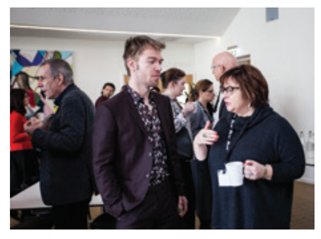
Photo: Networking break at Directors' Business Meeting, AIAS April 2019.